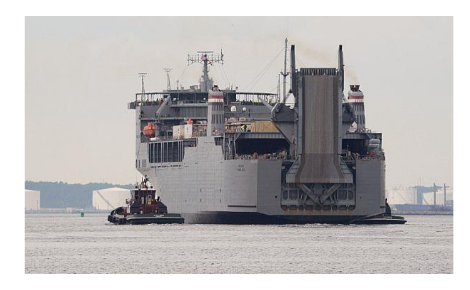
April 10 - Experts on board a cargo ship transformed into a multi-million dollar chemical weapons destroyer said on Thursday they were ready to start working on Syria's stock of toxic arms in the middle of the Mediterranean as early as May.