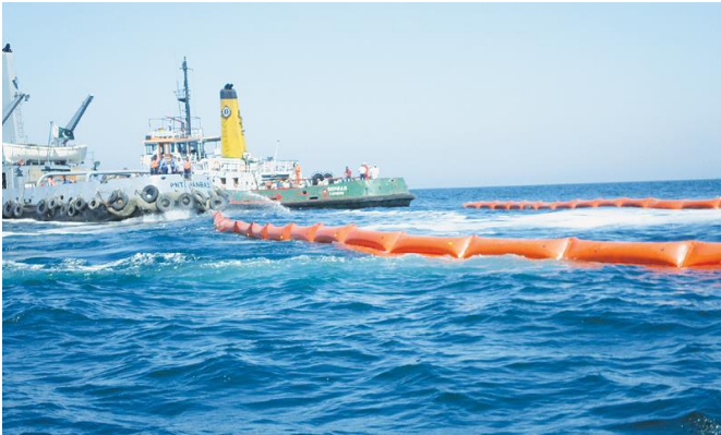
Picture: Pakistan Navy tug boat Janbaz and Karachi Port Trust's tug boat Sohrab are spreading reels of air-filled floating oil containment boom to stop a simulated oil spill from spreading any further during the Barracuda-V exercise conducted in the Arabian Sea on Thursday

Oil containment boom reels, skimmers, tug boats, ships, speed boats with all kinds of other sophisticated equipment and personnel handling it were busy trying to contain the damage in as little time as possible on Thursday.