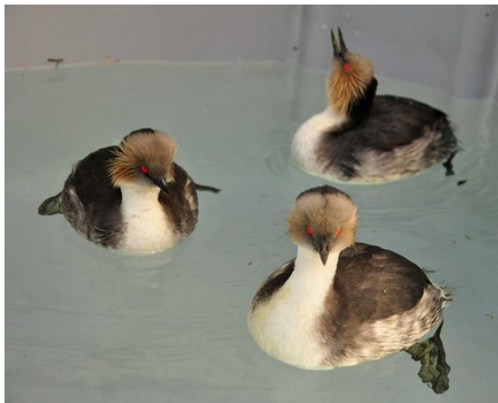
Photo: Local grebes swimming in a pool after being cleaned of oil spilled into Quintero Bay, Chile. Approximately 22,000 litres (approximately 5,600 US gallons) of oil spilled into the bay, soiling local wildlife.

An oil spill of approximately 22,000 litres (approximately 5,600 US gallons) in Quintero Bay in northern Chile on 25 September, saw myself (Valeria Ruoppolo) and Sergio Heredia with the IFAW Animal Rescue Team travel from Brazil and Argentina to assist with local efforts to rescue oiled wildlife involved with the spill.