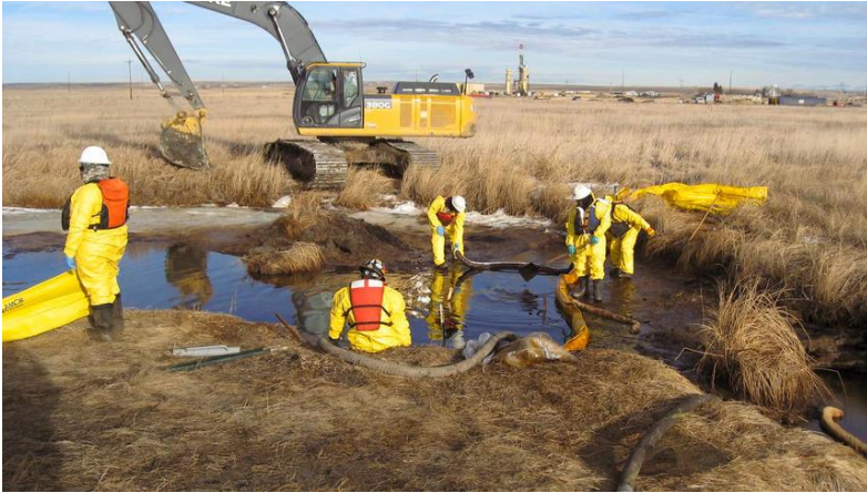
Photo: Crews work to recover oil from Blacktail Creek north of Williston, N.D., on Sunday, Jan. 25, 2015, after a pipeline leak released nearly 3 million gallons of saltwater that included some oil.

January 27 - Temperatures that reached into the 50s near Williston Tuesday hampered cleanup efforts at the site of a massive pipeline leak, making the contamination spread more quickly into the state's waterways, officials said. Melting snow and increased flows made it difficult for cleanup crews to collect some of the contamination in Blacktail Creek, said Dave Glatt, chief of the North Dakota Department of Health's Environmental Health Section.