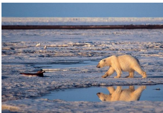
Photo: A polar bear is shown in the Arctic National Wildlife Refuge in Alaska.

January 26 - The Obama administration will propose setting aside more than 12 million acres in Alaska's Arctic National Wildlife Refuge as wilderness, the White House announced Sunday, halting any chance of oil exploration for now in the refuge's much-fought-over coastal plain and sparking a fierce battle with Republicans, including the new chair of the Senate Energy Committee.