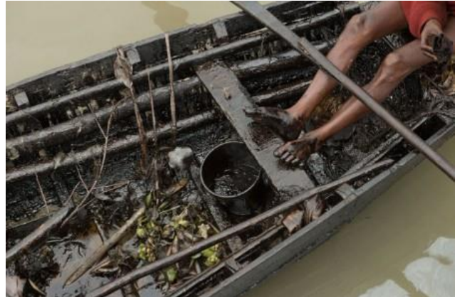
Sundarbans from an environmental perspective.

March 1 - The GoB-UN Joint Sundarbans Oil Spill Response Mission formally released its report on 1 March, at the CIRDAP auditorium.