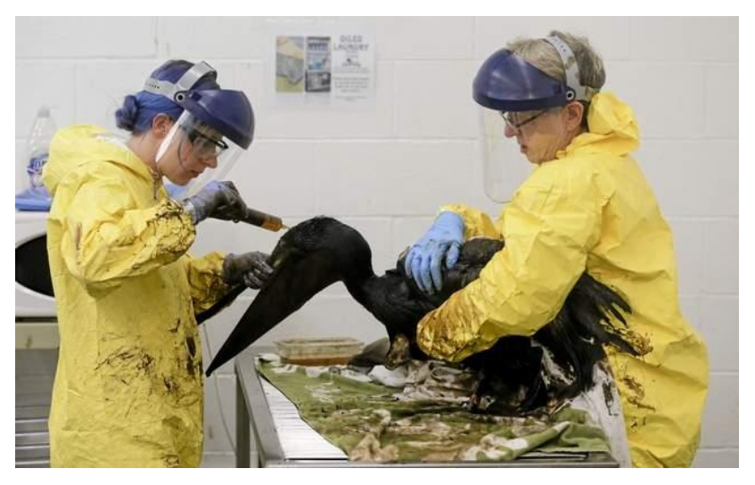
Photo: Staff members and volunteers work to clean oil off a brown pelican at the International Bird Rescue office in the San Pedro area of Los Angeles, on Friday. A broken onshore pipeline in near Santa Barbara spewed oil down a storm drain and into the ocean for several hours Tuesday before it was shut off.

May 23 - The nine-mile Santa Barbara coastline hit by an oil spill on Tuesday is even worse off than expected. Officials now say about 105,000 gallons of crude oil have spilled into Refugio State Beach, up from five times the original predictions.