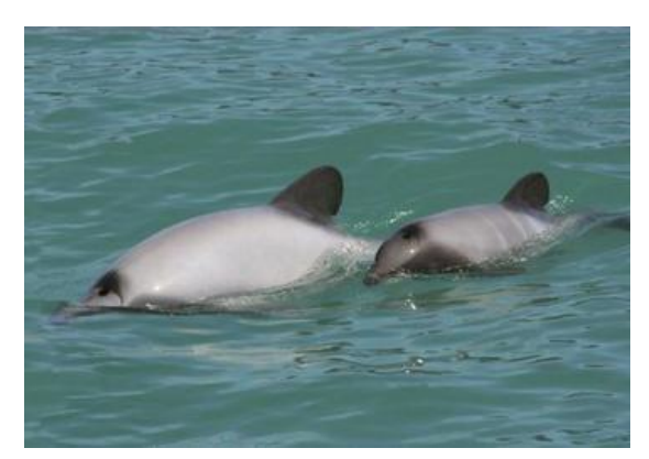
Photo: Maui's dolphins in the waters off New Zealand's North Island

Numbers of the world's smallest and rarest marine dolphin, New Zealand's critically endangered Maui's dolphin, have hit an all time low of 43-47 individuals, with just 10-12 adult females.