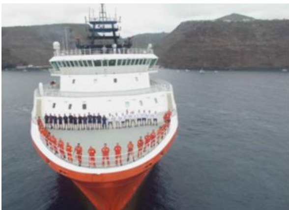
Photo on left - SPO's vessel crew, with the dive team and project manager from UK MOD, on the deck of Pacific Dolphin

On 26th June, both Pacific Dolphin and Pacific Supporter set sail for St Helena. The trip lasted seven days and the vessels experienced the full wrath of the South Atlantic in winter. The two SPO vessels were also joined by the Golden Oak, a 8,500gt product tanker, that would act as the reception vessel for the recovered oil.