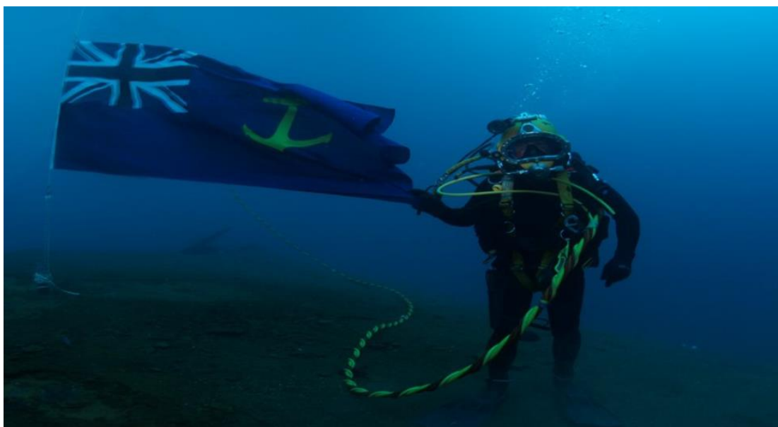
Above: RFA ensign placed on the wreck in remembrance of the sailors