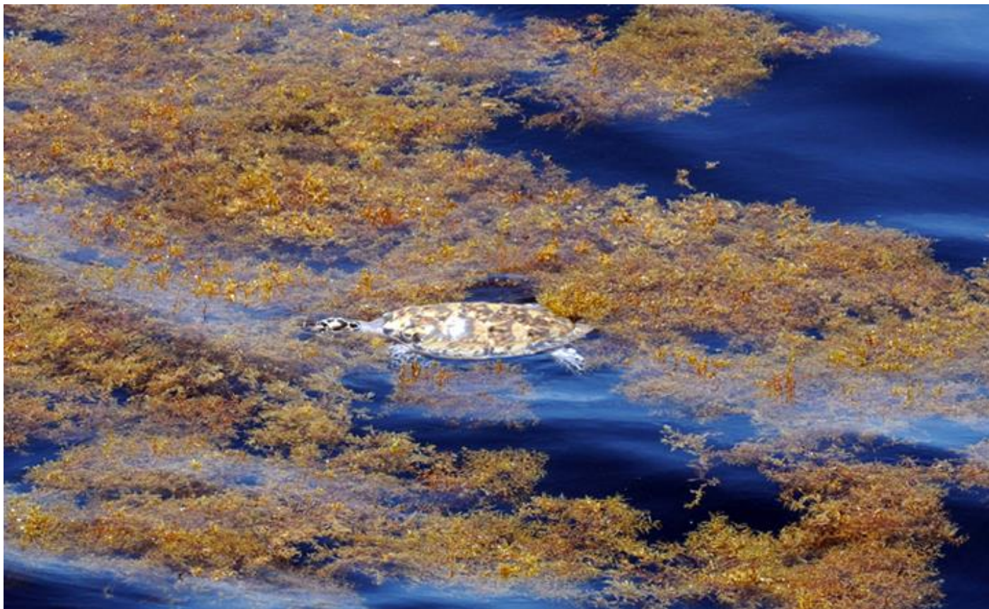
Photo: The floating habitat that sargassum creates provides food, refuge, and breeding grounds for an array of marine species, including sea turtles. (NOAA)