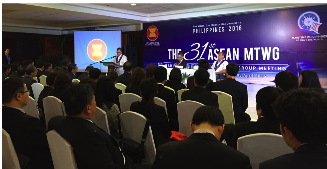
Figure 3. The ASEAN MTWG Meeting

The development of the ASEAN Regional Oil Spill Contingency Plan (ROSCP) is a key output of the regional component of the Strategic Framework. This work was started in October 2015 and became one of the commitments of the ASEAN countries when their Transport Ministers signed the Memorandum of Understanding on the ASEAN Cooperation Mechanism on Joint Oil Spill Preparedness and Response (ASEAN MOU) in 2014. This MOU effectively replaced the ASEAN OSRAP (Oil Spill Response Action Plan), which was not implemented. A Regional Training and Exercise Workshop, hosted by Malaysia, is planned for the third quarter of 2017 to test the Regional Plan.