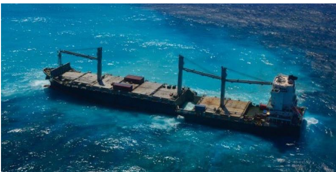
The 2017-built MV Kea Trader seen broken in two off New Caledonia.

November 13 - Severe weather in the South Pacific has caused the grounded Kea Trader to break in two over the weekend, further complicating an already difficult salvage operation that is now in its fifth month.