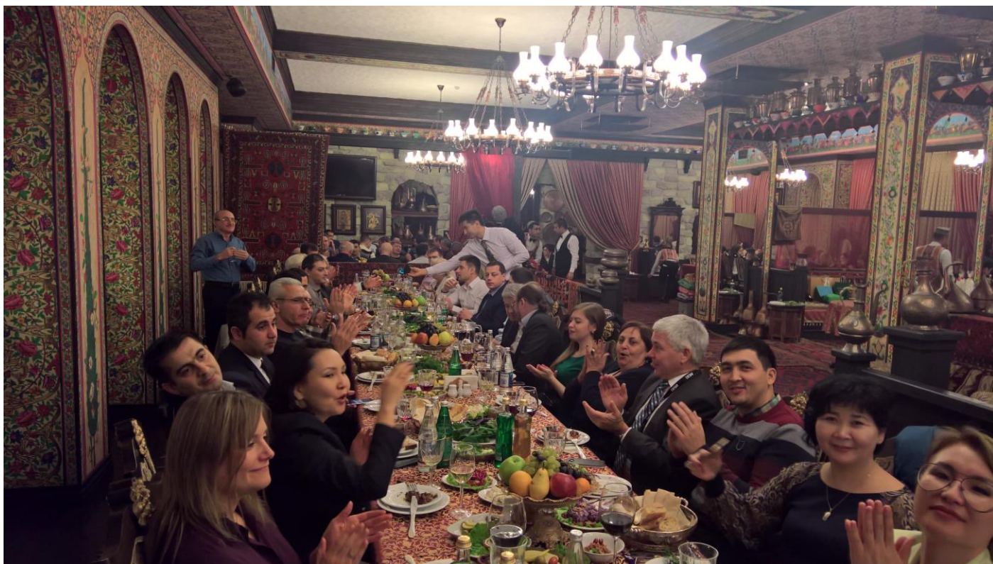
Above: Delegates at the Conference held in Baku celebrated at a magnificent dinner.

Last week the Secretary of ISCO attend the Oil Spill Control Caspian Conference in Baku Azerbaijan, organised by Confidence Capital.