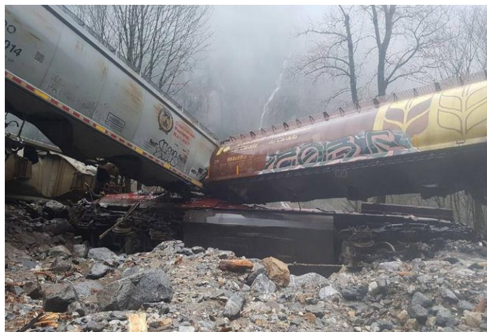
Photo: Train cars are seen at the site of a derailment north of Hope, B.C. in this undated handout photo. British Columbia's Environment Ministry says a rock slide north of Hope derailed a freight train and led to a fuel spill in the Fraser River.

November 24 - British Columbia's Environment Ministry says a rock slide north of Hope derailed a freight train and led to a fuel spill in the Fraser River.