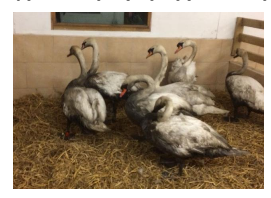
Photo: Swans contaminated from an oil spill in the River Lea are treated at The Swan Sanctuary.

February 20 - Waterways are shut between Stonebridge Lock just north of Tottenham and the bottom lock of the Hertford Union Canal in Hackney Wick. Both sets of gates are locked.