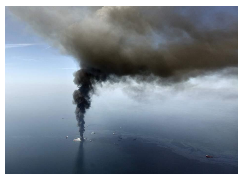
Government officials from the United States and Cuba will meet in Fort Lauderdale on an agreement to help one another in oil spill cleanups, like the Deepwater Horizon disaster in 2010.

February 21 – Two months after the Trump administration announced it would open no more of Florida's coast to oil drilling, U.S. government agencies will meet with their counterparts from Cuba about protecting the state's shores from oil spills there.