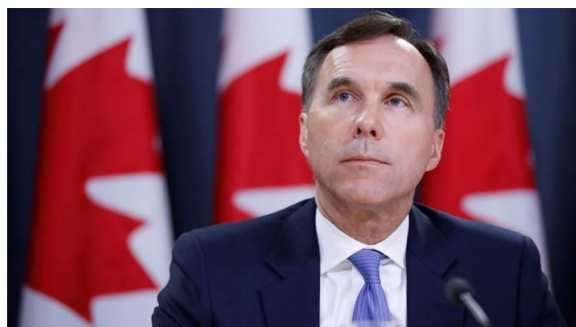
Photo: Finance Minister Bill Morneau announced today the government is buying the Trans Mountain pipeline for $4.5 billion.

May 29 - The Liberal government will buy the Trans Mountain pipeline and related infrastructure for $4.5 billion, and could spend billions more to build the controversial expansion.