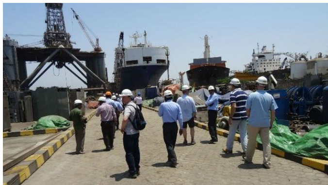
Photo: European shipowners in Alang, 2017.