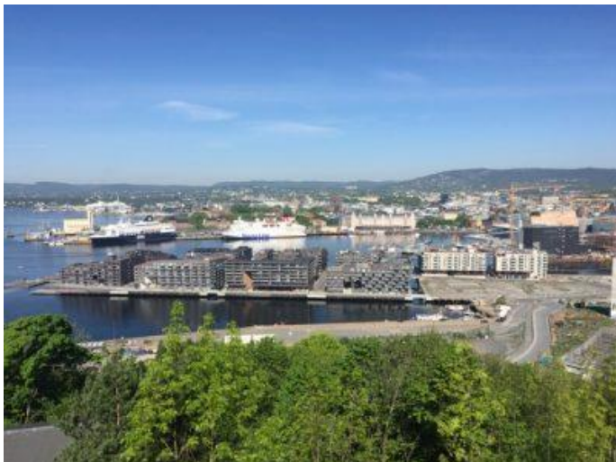
Photo: It was near this area of the inner Oslo Fjord that heating oil unleashed into the Alna River spilled further into the fjord. A popular swimming area was quickly closed, in the middle of Oslo's heat wave.

May 31 - Thousands of litres of heating oil spilled Wednesday afternoon into the Alna River that runs through Oslo's east side. By Thursday midday, oil slicks were sighted on the Oslo Fjord as far west at Bygdøy, and one of the city's most popular swimming areas was closed, right in the middle of a heatwave.