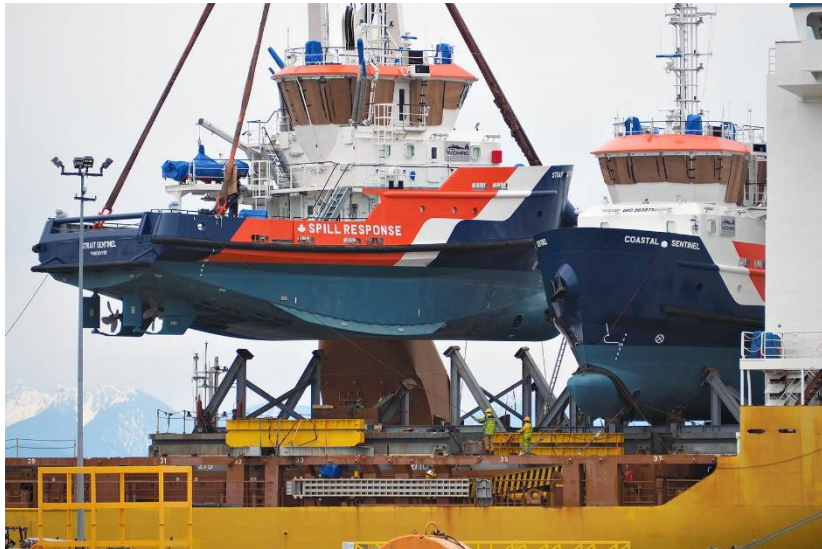
Western Canada Marine Response Corporation says three spill response boats will be delayed from entering service because there is no money available to crew and provision them due to delays surrounding the Trans Mountain pipeline project.

February 28 - Three coastal spill response boats unloaded in Nanaimo are becalmed by funding delays.