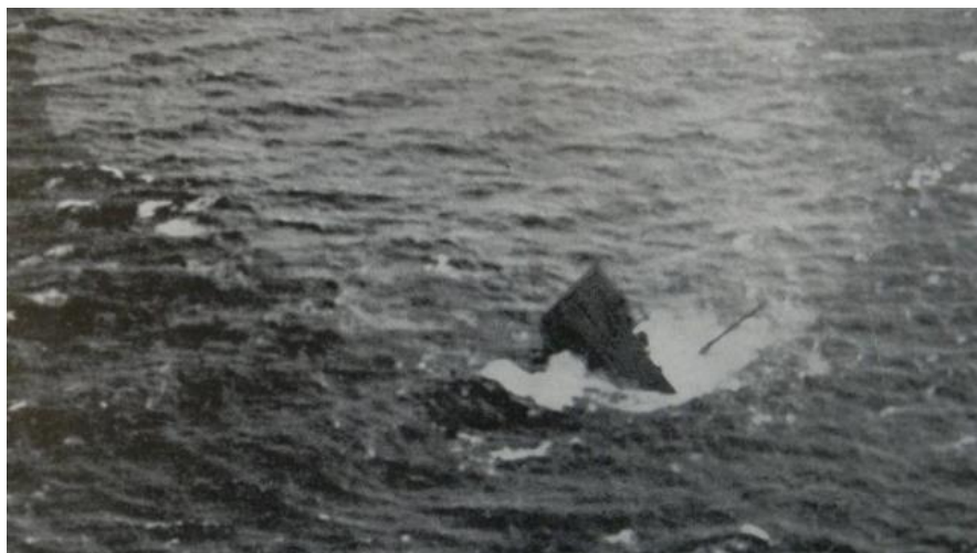
Photo: The bow of the Coimbra and the slick from her cargo, January 15, 1942

April 28 - Beginning Sunday, Resolve Marine Group will be conducting an assessment of the wreck of the WWII-era tanker Coimbra, which may still pose a pollution risk to the U.S. East Coast some 77 years after she went down.