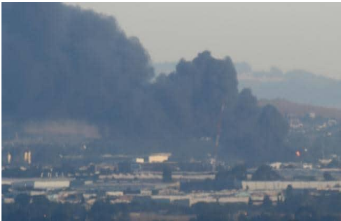
Photo: Authorities have seized more illegal waste dumps, following a factory fire at Campbellfield earlier this month.

Another four illegal chemical dumps in Melbourne's north have been taken over by authorities as Victoria ramps up its crackdown on potential waste inferno traps hiding in the suburbs.