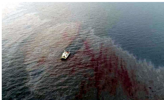
Photo: Another oil spill measuring 1.9 kilometres long was spotted about 4.5 nautical miles off Tanjung Punggai here during the Balau Oil Spill Response Ops 2 (OSR Balau 2) in the waters off Tanjung Balai this afternoon.

May 5 - Another oil spill measuring 1.9 kilometres long was spotted about 4.5 nautical miles off Tanjung Punggai here during the Balau Oil Spill Response Ops 2 (OSR Balau 2) in the waters off Tanjung Balai this afternoon. Johor Marine Department director Dickson Dollah said the oil spill, which is about 60 metres wide, was found by the monitoring teams on board the Al Nilam and At Tair vessels at 12.25 pm. "Following the discovery, cleaning operations commenced with the spraying of chemical dispersants," said Dickson when contacted. MSN News / Read more