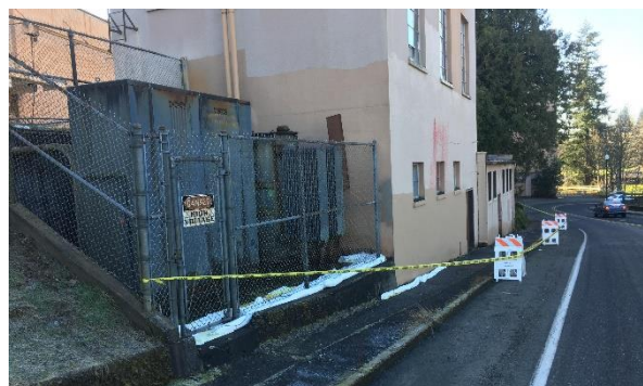
Photo: This transformer, seen behind the cyclone fence, leaked oil at the former Olympia Brewery site. Approximately 600 gallons of oil entered the Deschutes River and Capitol Lake.

May 24 – Ecology is initiating the next phase of cleanup operations, which will include the removal of contaminated lake sediment from heavily impacted areas in Capitol Lake. We are currently making preparations so divers can access contaminated areas from the shoreline wearing protective diving equipment to remove the top layer of lake sediments by suction. We expect this activity to begin sometime next week.