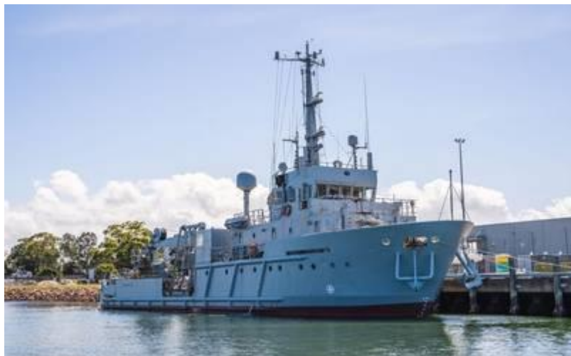
Photo: M.V. Ocean Recovery

May 23 - A remediation programme to protect island ecosystems from damage caused by oil pollution from World War II wrecks sunk in the Pacific Ocean launched in Newcastle Harbour on Thursday 23 May).