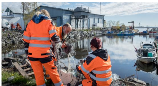
Photo: The project develops waste management and the collection of fishing gear. Unusable fishing gear was collected at Reposaari fishing harbour in the spring 2019.

May 29 - Ghost nets refer to nets and other gear lost by fishermen that fish by themselves in seas and bodies of water. They are harmful to animals and constitute a part of the plastic problem in the seas. The Finnish Environment Institute (SYKE) and the Finnish Fishermen's Association (SAKL) have started to investigate the ghost net situation in the Bothnian Sea.