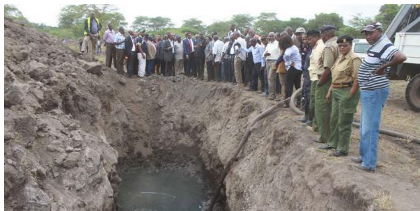
Photo: A team led by Petroleum and Mining CS John Munyes during a visit to the Kiboko oil spill site in Makueni County on June 3.

June 9 - A tender row on a system to detect leakages on the new oil pipeline has occasioned heavy losses to oil marketing firms amid uncertainty over the exact quantity of fuel lost.