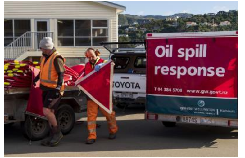
Photo on left: Staff from across Greater Wellington geared up to take part in an oil spill response exercise at Island Bay.

June 11 - Staff from across Greater Wellington Regional Council geared up to practise protecting our harbours and wildlife in the event of an oil spill last week.