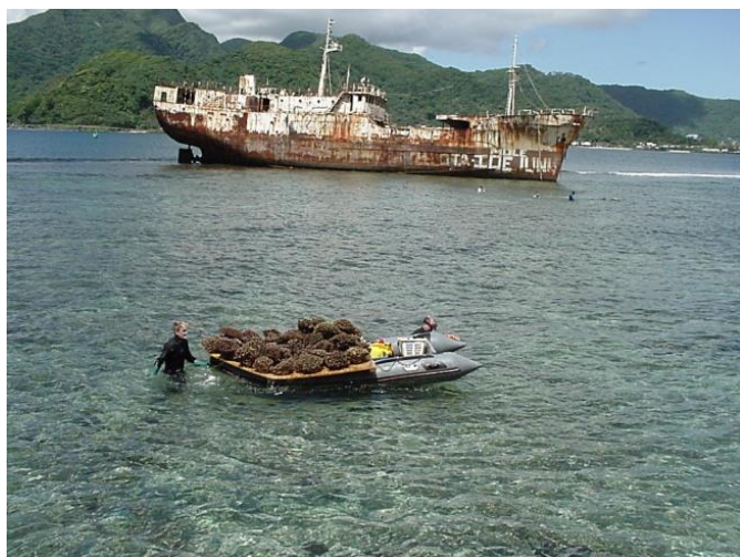
Transplanting corals from a grounded derelict vessel in American Samoa.

Removing the wrecks would cause more damage to the coral reef, so NOAA proposed an innovative solution — use the Natural Resource Damage Assessment authorities under the Oil Pollution Act to restore the reef damaged both by the vessel groundings and the vessel removal process using the Oil Spill Liability Trust Fund. It was the first time the fund was used for emergency restoration. In 2000, after a nearly nine year response effort, 36,000 gallons of oil and 600 pounds of pure ammonia were removed from Pago Pago Harbor along with the wrecks. The restoration of several aspects of the biological environment, including the coral reef ecosystem, totaled $3 million.