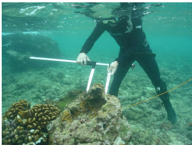
Surveying corals in Pago Pago Harbor, American Samoa.

During one restoration project, over 300 coral colonies were transplanted from a planned causeway into the space left by one of the removed vessels. The survival rate of the transplanted coral was 91 to 92 percent in 2001 and 60 to 78 percent by 2005. This work may be the first documented coral restoration effort in American Samoa.