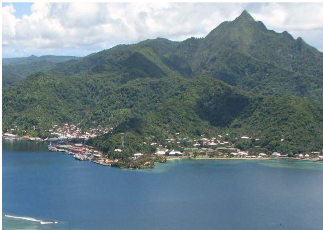
Pago Pago Harbor in American Samoa.