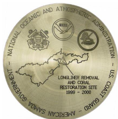
In 2005 NOAA's National Geodetic Survey dedicated a commemorative mark in Aua Village overlooking Pago Pago Harbor highlighting the restoration of the coral reef ecosystem damaged by the vessel groundings.

The response in Pago Pago Harbor occurred not only during an important period for the development of NOAA's oil spill response capacity through the Office of Response and Restoration, but also during an important period for the expansion of NOAA's coral reef conservation capacity. In 1998, an executive order established the U.S. Coral Reef Task Force and identified the Commerce secretary, through the NOAA administrator, as a co-chair of the task force. Two years later, the Coral Reef Conservation Act of 2000 instituted NOAA's Coral Reef Conservation Program .