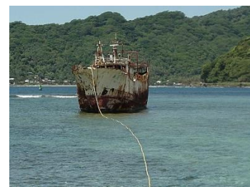
Pumping oil from a derelict vessel in American Samoa.