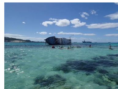
The large fishing vessel, Lady Carolina, is grounded in a lagoon reef off the coast of Saipan.