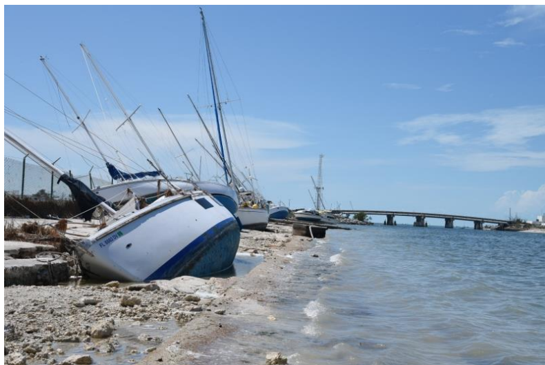
Photo: Derelict vessels in Key West, Florida following Hurricane Irma.

During the 2017 hurricane season, the Caribbean, southeast, and Texas experienced severe damage to communities and the environment. The destruction from hurricanes Harvey, Irma, and Maria brought large amounts of debris from homes, fishing gear, and vessels. Emergency response colleagues in NOAA supported interagency response teams to resolve many displaced vessels that threatened to cause environmental harm and become derelicts as described in this article about 2017 Caribbean emergency response efforts . However, substantial amounts of marine debris remained. With financial support from the MDP, coastal states and territories impacted by these hurricanes received $17.2M in disaster relief funding to assess, remove, and dispose of hurricane-related marine debris .