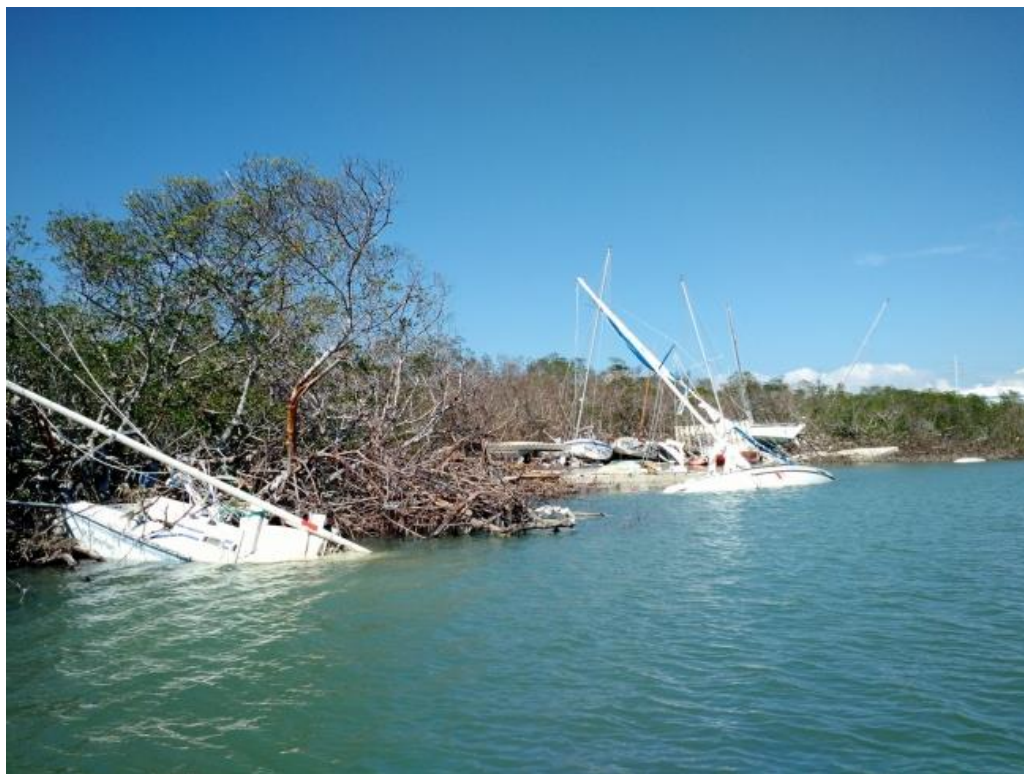
Derelict vessels in Boot Key Harbor following Hurricane Irma.