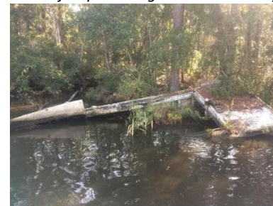
Abandoned and derelict vessels like this one are a hazard in the Weeks Bay estuary, and crush sensitive marsh habitat.

In the Commonwealth of the Northern Mariana Islands, Pacific Coastal Research and Planning is teaming up with the MDP to remove the derelict F/V Lady Carolina from the waters of the Saipan Lagoon. This large 83-foot, 54-ton, steel-hulled fishing vessel broke free from its mooring during the devastating passing of Category 4 Typhoon Soudelor in August 2015, and has been grounded in Saipan’s ship channel. Removing the vessel will not only rid this popular recreational area of an eyesore, but will prevent further environmental impacts to coral reefs and endangered species, and give the surrounding community closure from the typhoon.