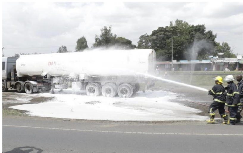
Photo: Firefighters from Nakuru County spray foam on a fuel tanker that was leaking petrol near Stem Hotel along the Nakuru-Nairobi highway yesterday. [Harun Wathari, Standard]

[Editor: I have included this report because it's relevant to the article on Page 2 of this newsletter. In this case a police strategy worked to prevent a potential tragedy ... It was fortunate that it was possible mobilise police quickly enough and in sufficient numbers to create an effective isolation zone]