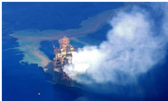
Photo: Oil leaked from the faulty rig in the Montara field in the Timor Sea.

August 20 - The new operator of the site of Australia's worst ever oil spill has dismissed concerns it might not have the financial capacity to clean up should disaster strike again.