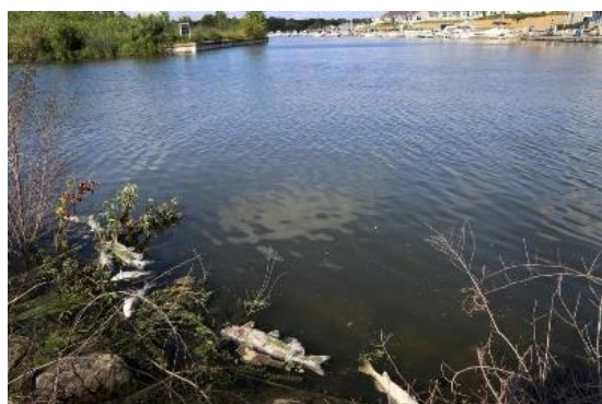
In this Thursday, Aug. 15, 2019, photo several dead fish float along the bank of Burns Ditch near the Portage Marina in Portage, Ind. Some beaches along northwestern Indiana's Lake Michigan shoreline are closed after authorities say a chemical spill in a tributary caused a fish kill.

August 16 - Going in the water was not allowed Friday afternoon at the beach in Portage, Indiana. The problem was dangerous chemicals that spilled out into the Little Calumet River – leaving hundreds of fish dead as a direct result.