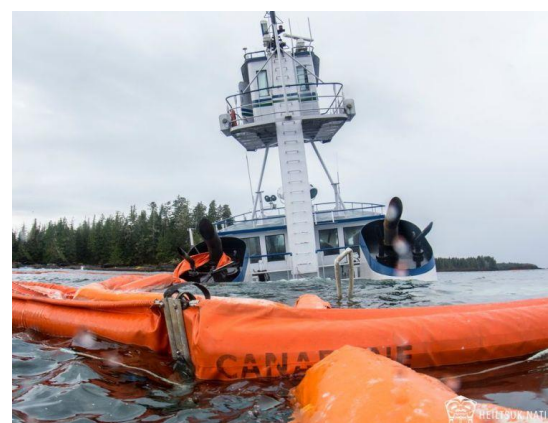
Photo: Tugboat Nathan E. Stewart sits in the Inside Passage on B.C.'s coast after sinking in Oct. 2016.

August 20 - A B.C. judge has ruled that close to $3 million in fines imposed on the operator of a tug that hit a reef and sank in the Inside Passage in 2016 be handed to put into an environmental damage fund administered to benefit the Heiltsuk Nation.