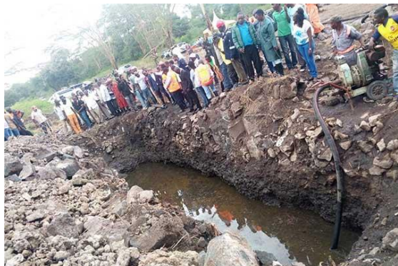
Photo: A crowd gathers around an inspection trench sunk by Kenya Pipeline Company to check the spread of oil following a leak.

August 22 - Kenyans will not meet the costs arising from the loss of 11 million litres of fuel along the country's pipelines reported last year, the energy regulator has said.