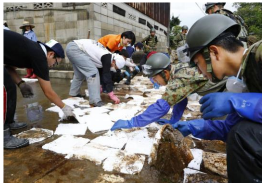
Photo: Local residents and Self-Defense Force members place absorption sheets on a street in Omachi, Saga Prefecture, to remove oil washed away from a flooded ironworks after torrential rain on Wednesday.

September 1 - Volunteers gathered over the weekend to help clean up parts of Saga Prefecture flooded by torrential rain on Wednesday, but oil leaking from an ironworks is compounding their troubles.