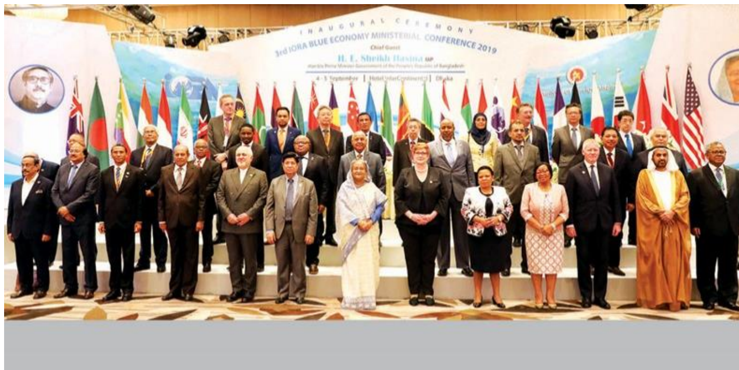
Above: Prime minister Sheikh Hasina, together with participants of the IORA Blue Economy Ministerial Conference, poses for a photo during the inaugural session of the conference in a Dhaka hotel on Thursday.

This was said in the Dhaka declaration of a ministerial conference of the Indian Ocean Rim Association (IORA) on blue economy held in Dhaka. It was the third IORA conference of this kind hosted by Bangladesh as the country is all set to become the chair of the inter-governmental organisation in 2021.