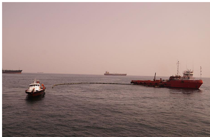
Photo: One of Fairdeal's Diva U-Booms in the water

September 1 - Fairdeal Marine Services has operated a MARPOL reception facility in Fujairah, UAE, for many years, and has also catered to the needs of a number of principals, both offshore and onshore, by providing Oil Spill Response (OSR) capabilities.