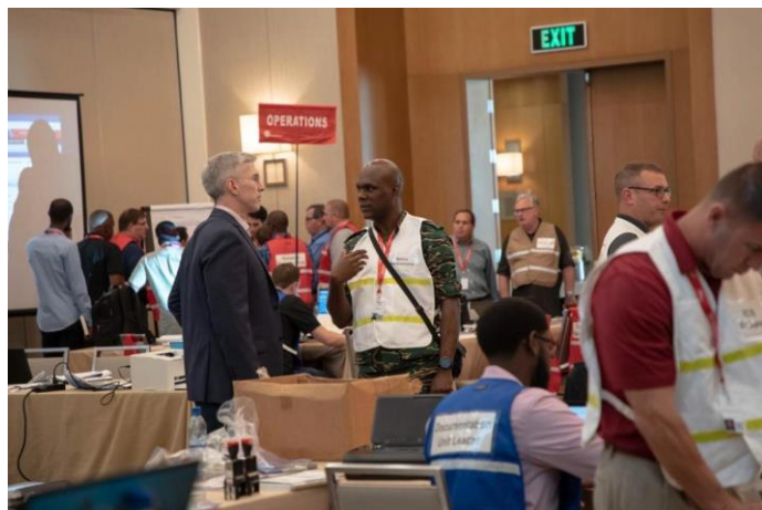
Photo: More than 100 persons have participated in emergency response training organized by ExxonMobil Guyana [ExxonMobil Guyana photo]

September 3 - More than 100 persons have participated in emergency response training organized by ExxonMobil Guyana as part of its continued effort to prepare in the unlikely event of an oil spill.