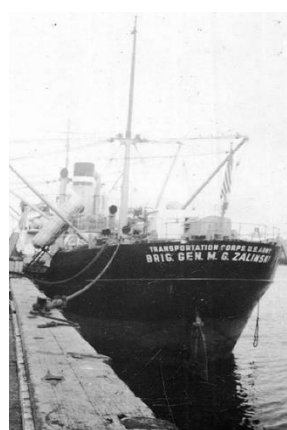
Photo: Built in 1919, the Brigadier General M. G. Zalinski transported cargo for the United States military until it sank one year after the end of the Second World War.

September 10 - A Second World War-era shipwreck is a haunting reminder that you can never fully clean up an oil spill.