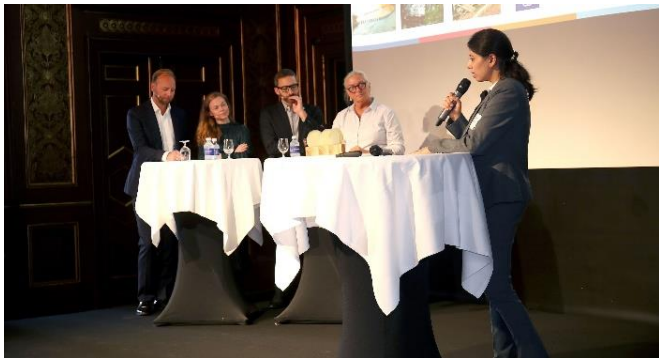
Photo: DESMI concept EnviRo-Clean wins award from The Danish Chamber of Commerce

September 12 – Recently, DESMI EnviRo-Clean won the 360 degree award. DESMI EnviRo-Clean is very committed to the UN sustainable development goals due to its constant efforts to combat marine debris from waterways all around the world, before it enters into the ocean.