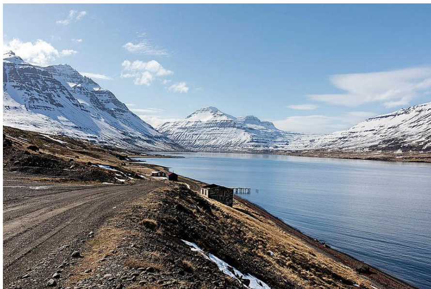
Photo: From Seyðisfjörður.

September 7 - The town of Seyðisfjörður, the East Fjords, is in deep trouble – literally. Leakage from a British oil tanker, destroyed there by German military aircraft on February 10, 1944, is still polluting their fjord after all these years.