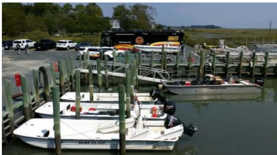
Photo: Spill response vessels: Vessels, including the VIMS landing craft RV Peregrination, prepare to transport communication gear to Parramore Island. The Suffolk Fire Department's support bus (background) facilitates communication among responders using different frequencies and equipment.

September 23 - Virginia's Eastern Shore preserves some of the most pristine barrier islands and saltmarshes in the world. Just offshore lies a busy shipping lane traversed by vessels moving between the ports of the Chesapeake Bay, Delaware Bay, and the New York-New Jersey metropolis.