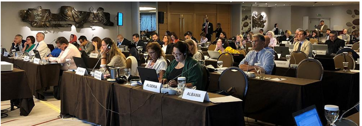
Above: Representatives of Mediterranean States and the European Union discussed new measures aimed at curbing pollution, protecting biodiversity and stimulating blue growth in the Mediterranean region.

September 13 - Focal Points of the United Nations Environment Programme/Mediterranean Action Plan (UNEP/MAP) met in Athens on 10-13 September 2019 to examine the progress on activities carried out during the 2018-2019 biennium, the Programme of Work for the next two years (2019-2020) and several draft decisions to be submitted for adoption to the 21st Meeting of the Contracting Parties to the Barcelona Convention (COP21, 2-5 December 2019, Naples, Italy). UNEP MAP / Read more