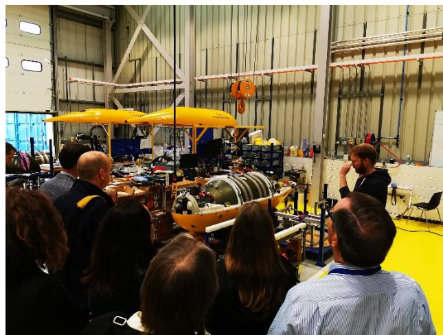
Above left: AUVs at the Southampton NOC. Above right: ITAC delegates inspect other equipment at the NERC Centre

October 12 - Last week saw the latest of the annual Industry Technical Advisory Committee for oil spill response meeting held over three days 2nd -4th October at the National Environmental Research Council's, National Oceanography Centre in Southampton, UK.