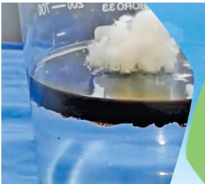
The separator being immersed in oil

November 3 - The Sri Lanka Institute of Nanotechnology (SLINTEC), a pioneer in nano and advanced technology and research has developed an advanced oil-water separator to remove hazardous liquid waste from water, a cleanup process that could save billions of dollars to the economy, a top official of the Institute told the Business Observer on Friday.