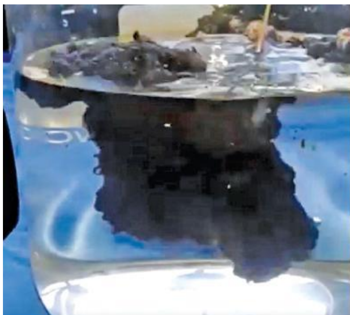
The oil separator after absorbing oil