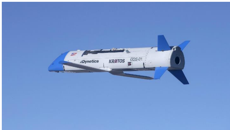
Photo: The Dynetics X-61A Gremlins Air Vehicle in flight.

In this week's roundup from the Association for Unmanned Vehicle Systems International, which highlights some of the latest news and headlines in unmanned vehicles and robotics, the Defense Advanced Research Projects Agency (DARPA) gives an update on an experimental drone that can be recovered in the air, residents of Illinois, USA embrace drone flights, and Texas A&M University-Corpus Christi begins automated passenger shuttle services.