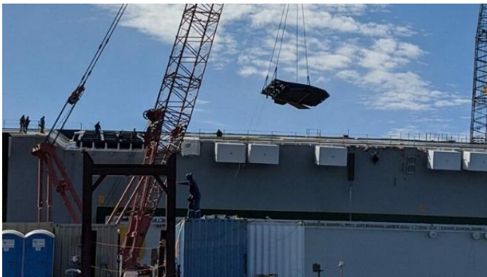
Photo: Ramp being removed from Golden Ray

February 1 - The Unified Command (UC) responding to the grounding of the car carrier Golden Ray is finalizing plans for the construction of an environmental protection barrier to be built around the vessel.