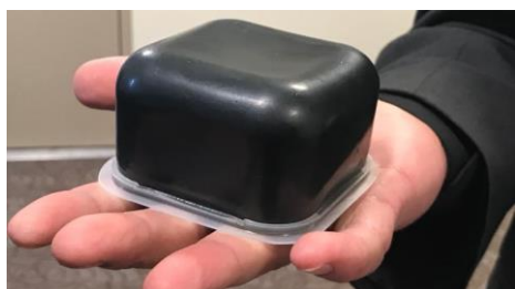
Easy to transport, CanaPux are about 7 cm wide, 7 cm long and 5 cm deep.

January 17 - As a puck made of oilsands bitumen was tossed into the air, railway executive James Auld joked, "we almost had an oil spill there."