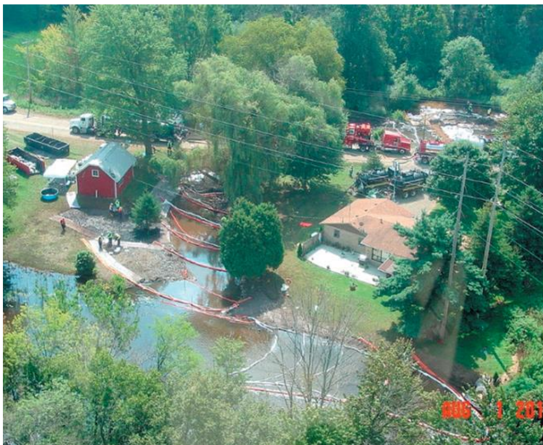
Above: An oil spill response operation is conducted around a private residence.

The process of setting response priorities using shoreline clean-up and assessment techniques applies to both marine and inland habitats. Assessment methodologies may have to be expanded because of the greater number of shore types encountered during an inland spill, and as tidal influences are replaced by possible fluctuations due to varied water flows.