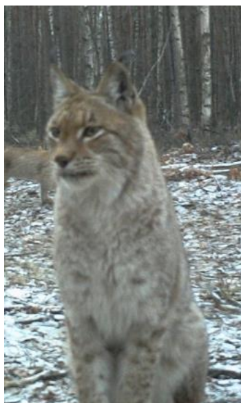
Photo: A host of animals, including Eurasian lynx, have returned to the Chernobyl area.

September 16 - Many people think the area around the Chernobyl nuclear plant is a place of post-apocalyptic desolation. But more than 30 years after one of the facility's reactors exploded, sparking the worst nuclear accident in human history, science tells us something very different.