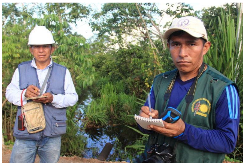
Photo: Environmental monitors travel through their territory to identify any new threats or old damages.

October 6 - A recent report called "The shadow of oil" revealed that 474 oil spills occurred along the NorPeruano Pipeline in Peru and on several oil blocks between 2000 and 2019.