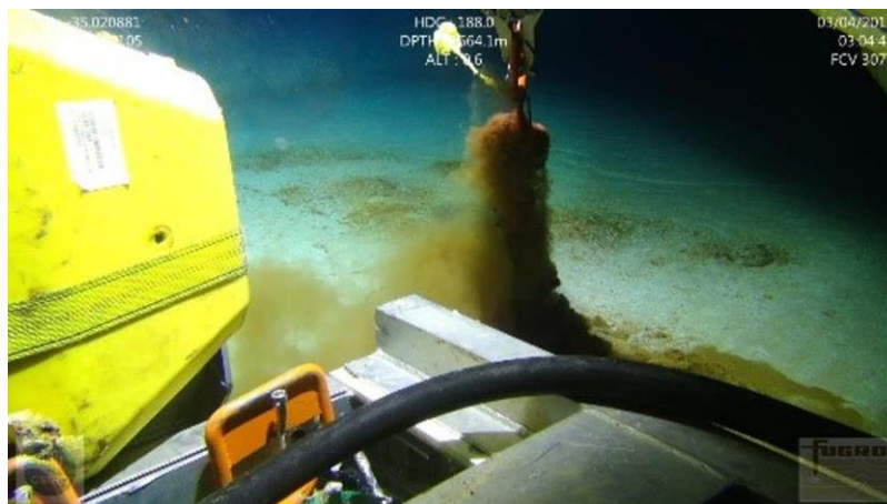
Sampling of deep sea sediments took place using an underwater robot.

Nowhere, it seems, is immune from plastic pollution: plastic has been reported in the high Arctic oceans, in the sea ice around Antarctica and even in the world's deepest waters of the Mariana Trench.