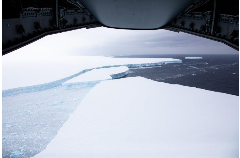
A Royal Air Force photo published December 9, 2020, shows the massive size of the A68a iceberg.

December 9 - An enormous iceberg is heading toward South Georgia Island in the southern Atlantic, where scientists say a collision could devastate wildlife by