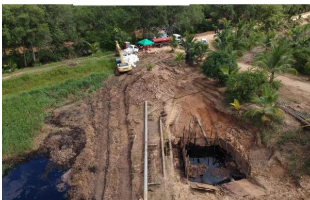
Heavy equipment mobilized by Heritage Petroleum continues containment of an oil spill in the South Oropouche lagoon and the Gordineau River.