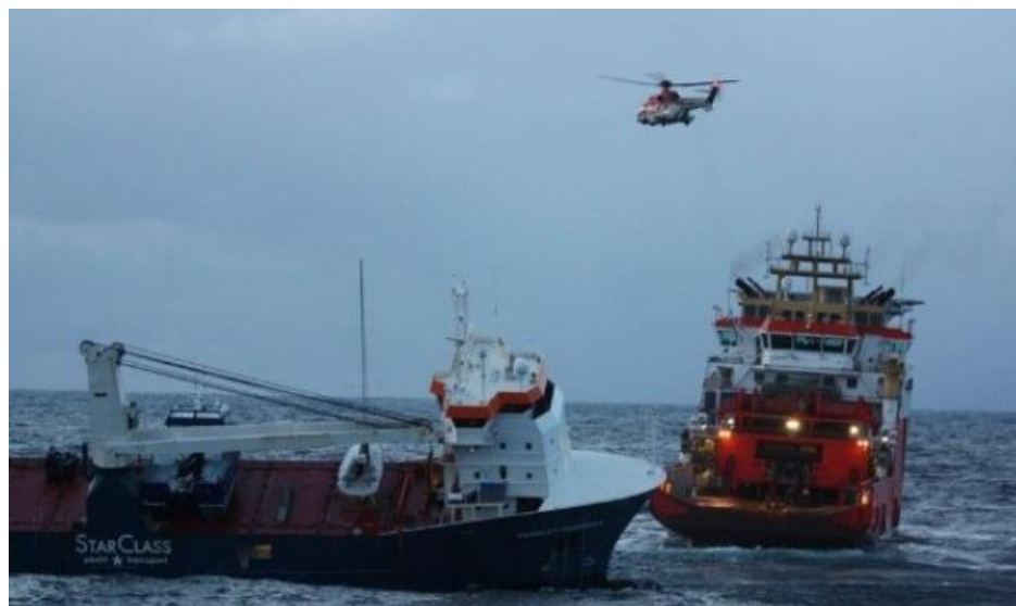
Photo: Emergency actions secured the tow line to the Emslift Hendrika

April 7 - Emergency Action Secures Heavy-Lift Vessel as it Nears Norwegian Coast