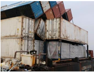
Photo: Toppled containers are seen in this photo taken after the June 22, 2020, accident aboard the barge Ho'omaka Hou.

April 21 - Poor barge loading resulted in the loss of 21 cargo containers into the ocean off the coast of Hawaii last year, the National Transportation Safety Board said in its report on the accident. The barge Ho'omaka Hou, owned and operated by Young Brothers, LLC, was being towed by the Hoku Loa approximately 6.9 nautical miles north-northwest of Hilo at the time the June 22, 2020 accident. The accident resulted in $1.6 million in damages, but no injuries. gCaptain / Read more