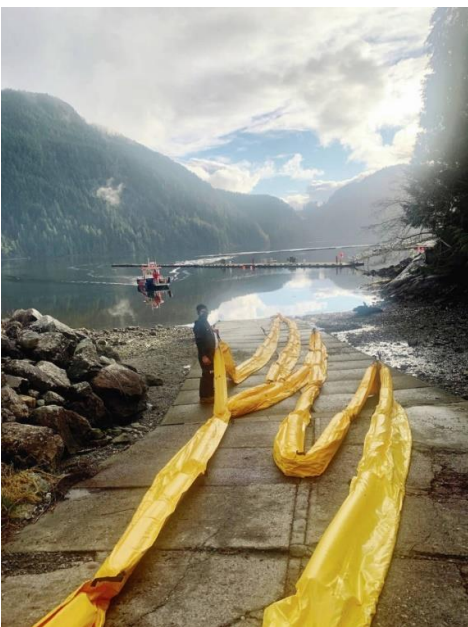
Photo: Boom deployed in Nootka Sound where a 50-year-old shipwreck is leaking oil. CANADIAN COAST GUARD

April 23 - An American crew has arrived in Nootka Sound to begin assessing and patching the wreck of the MV Schiedyk, the 50-year old shipwreck near Blich Island that has been leaking bunker oil and fouling waters in the Zuciarte Channel for five months.