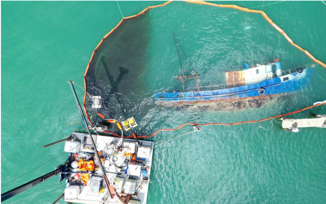
Above: A skimmer cleans oil from the sea at Careys Bay in Port Chalmers.

October 13 - More than 3300 litres of oily water has been removed after a spill from a sunken boat near Dunedin. The 18m, 60 tonne vessel sank at its wharf berth at Careys Bay in Port Chalmers on Tuesday. Otago Regional Council deputy harbourmaster Pete Dryden said two mechanical skimmers had been cleaning up the spill since then. Radio NZ / Read more