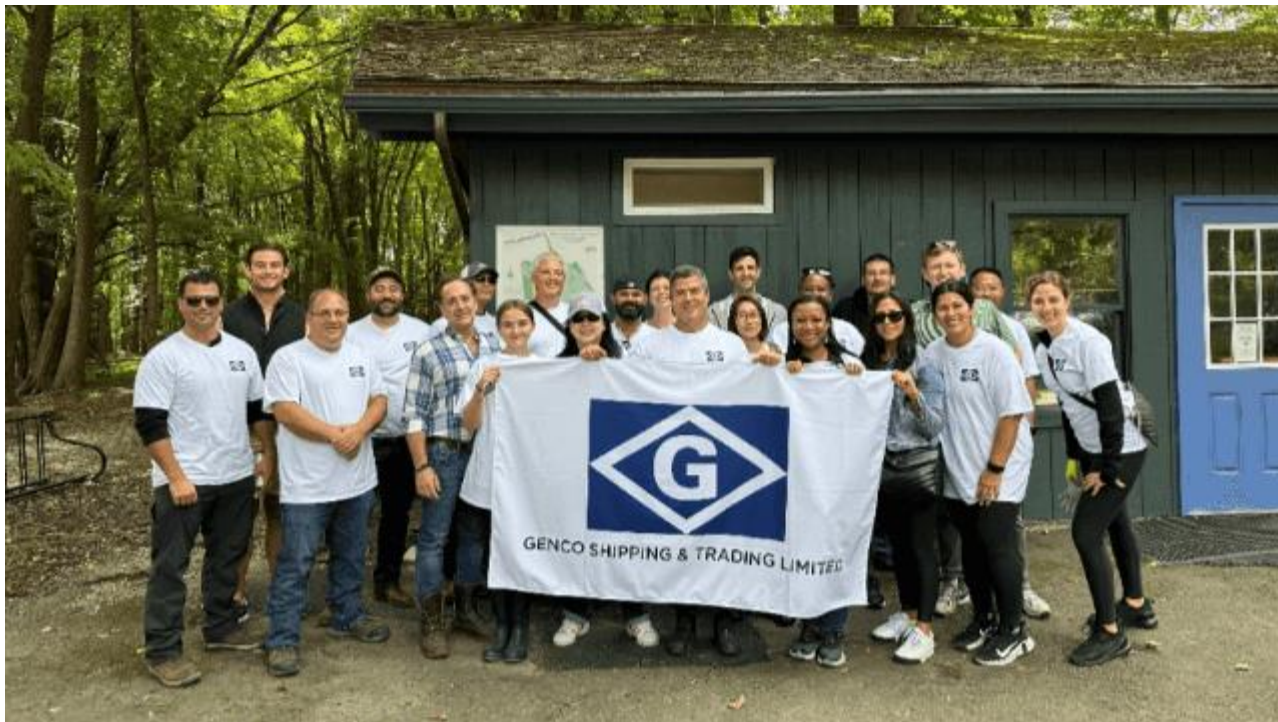
Above - Genco and NAMEPA Teams

October 9 - The North American Marine Environment Protection Association (NAMEPA) is thrilled to announce its partnership with corporate member, Genco Shipping & Trading, for the celebration of International Coastal Cleanup Day (ICC). This year marked the 4th annual cleanup event, held at a new location, the Marshlands Conservancy in Rye, New York. The Maritime Executive / Read more