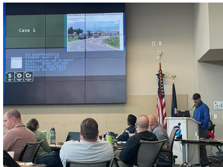
Photo; Students studying case studies during the March 2024 Science of Chemical Releases Class in Mobile, AL.

SOCR is a four-day intensive training designed to help spill responders and planners increase their understanding of chemical spill science when preparing for and analyzing chemical spills, and making risk-based decisions to protect public health, safety, and the environment.