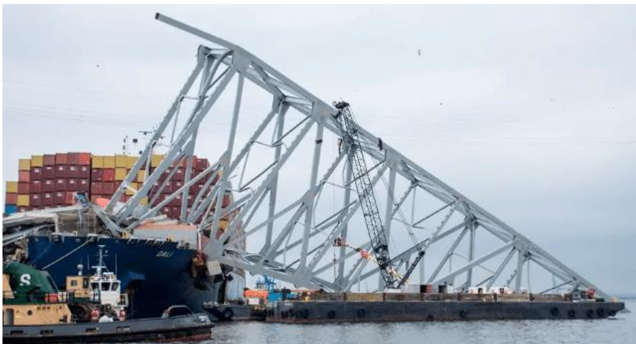
Above: Section four atop Dali's port bow

May 7 - The unified command tasked with overseeing the refloat operation has previously hinted at a precise, simultaneous, safe cutting method that would safely free up section four. The task will be accomplished with precision explosives, a Coast Guard spokesperson confirmed. The Maritime Executive / Read more