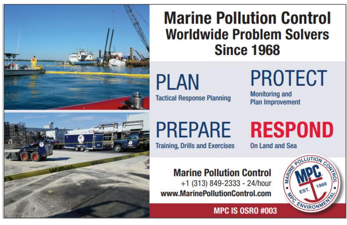
CLICK ON THE ABOVE ADVERTISEMENT FOR MORE INFORMATION

UK – SEPA June 2024 Update PEMSEA Ebulletin 28 June 2024 GEF June 24 Newsletter