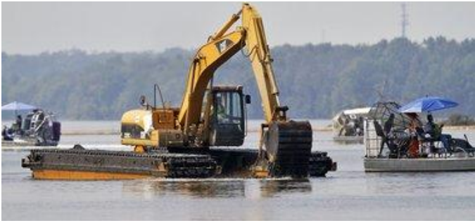
Picture: An excavator digs into the bottom of Morrow Lake during cleanup following the 2010 Kalamazoo River oil spill.

Enbridge, Inc. has suspended its dredging operations at Morrow Lake until spring, a company spokesman said Thursday.