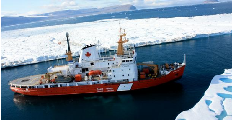
Photo: Canadian and U.S. scientists use the Canadian Coast Guard vessel, the CCGS Henry Larsen, in August 2012, to retrieve instruments assessing ice and currents in the region

More than $100 million in cuts are underway at the federal department in charge of protecting Canada's water and oceans, despite recommendations from top bureaucrats that it needs to increase spending for both environmental and economic reasons.