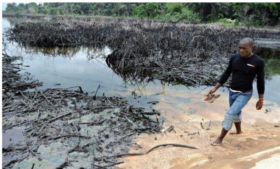
Photo: A man walks near the spilled Shell crude oil on the shores of the Niger Delta swamps of Bodo, Nigeria. Photograph: Pius Utomi Ekpei/AFP/Getty Images

The first judgment in what lawyers have said could be one of the world's largest ever environmental trials has ruled that Shell may have to compensate some communities for oil spills from their pipelines caused by criminals in the heavily polluted Niger delta.