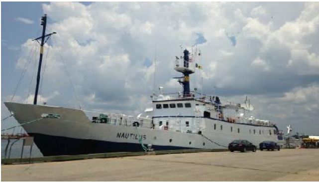
Photo: Research Vessel Nautilus - Oceanographer Dr. Robert Ballard founded the "Ocean Exploration Trust," which owns the Nautilus. He is most known for discovering the wreck of the Titanic in 1985.

As the Nautilus prepared to launch the next leg of its expedition, nearly 200-members of the Boys and Girls Clubs walked on deck to see how the remotely operated vehicles are used for deep sea research. They even got to build and test their own miniature ROVs.