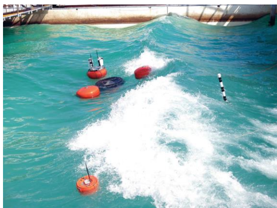
Photo on left: A tagging system equipped with a wave characterization module is mounted to a skimmer to track the skimmer location and wave conditions during spill response operations.

That is what AECOM of Gaithersburg, Maryland has set out to do. They recently developed a Geo-Referencing Identification (GRID) tagging system capable of long-term equipment tracking and equipped with a Wave Characterization Module (WCM).